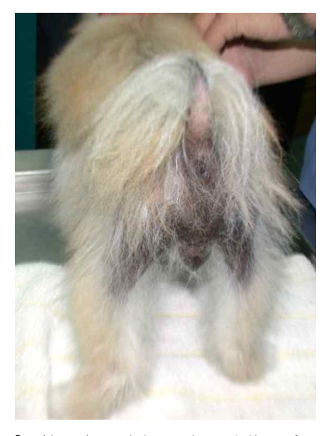
Fig 2. Alopecia and hyperpigmentation of caudal areas.

Macule, plaque, pustule, scale, hyperpigmentation and alopecia were found under dermatoscopy