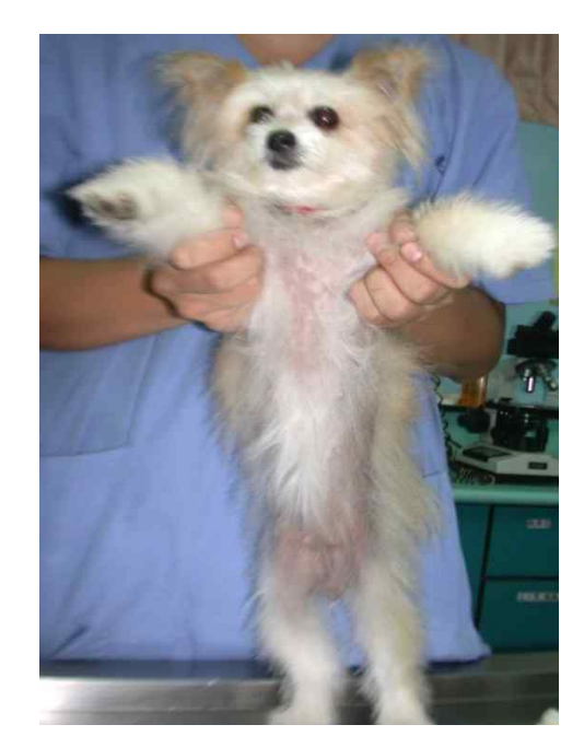
Fig 1. Alopecia of the ventral areas.

(Koda video skin analyzer, Koda Co., Taiwan).