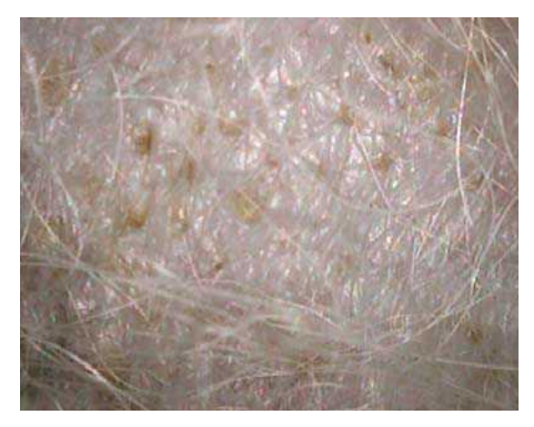
Fig 3. Pustule, macule and alopecia under dermatoscopy.

Microscopically, thin layer epithelia, multiple folding