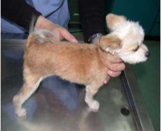
Fig 4. Hair regrowth of the patient after treatment.

Thyroxine (Thyro-tab<sup>®</sup>, 0.3 tab MID, PO, A Division of Lloyd Inc. USA), pyridoxine hydrochloride (vitamin B6<sup>®</sup>, 50 mg/tab, 0.3 tab, PO, Taiwan Chemical Co., Taiwan) and